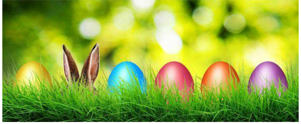
At Kersbrook Primary School we value Respect, Responsibility, Confidence and Success