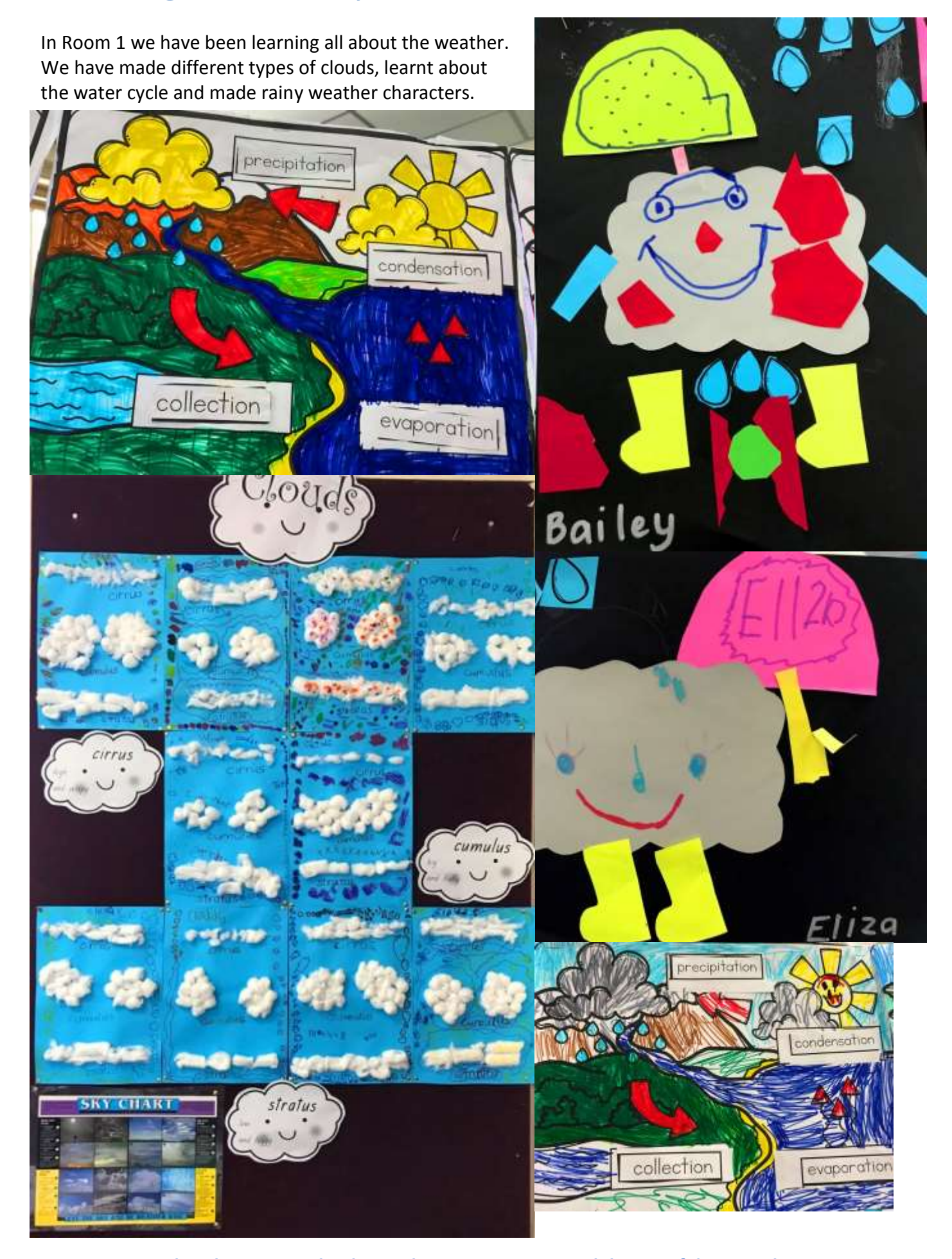
At Kersbrook Primary School we value Respect, Responsibility, Confidence and Success